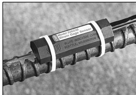
Spot-weldable strain gauge installed on reinforcing bar. The gauge is later waterproofed with mastic and tape.

Corrosion protection is applied to the gauge, and then the strain gauge sensor is placed on top of the sensor. After test readings, the sensor is fixed to the gauge either by weldable steel straps or by tie-wraps. The gauge and sensor are then wrapped with mastic and tape.