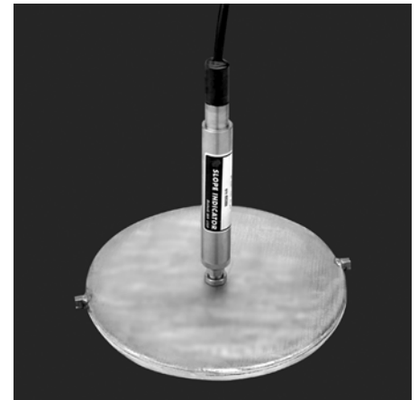
Jackout Total Pressure Cell