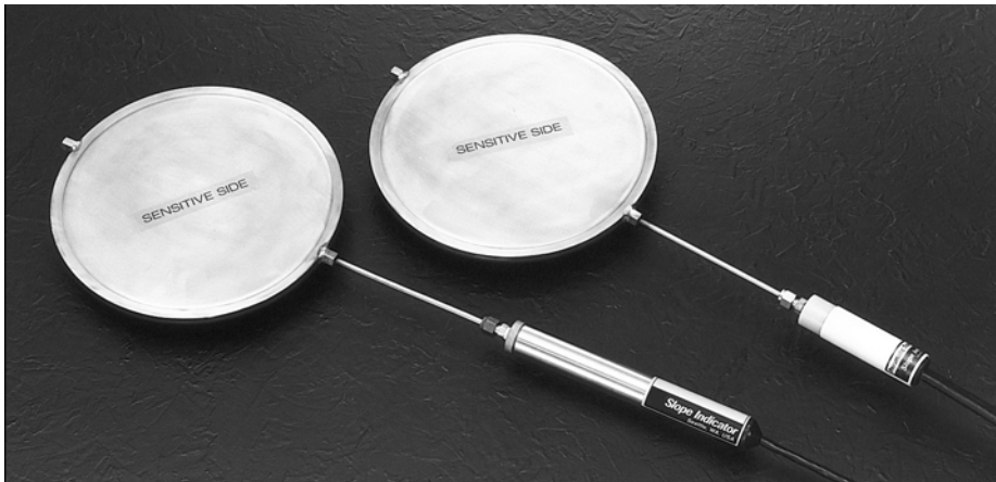
Vibrating Wire and Pneumatic Total Pressure Cells